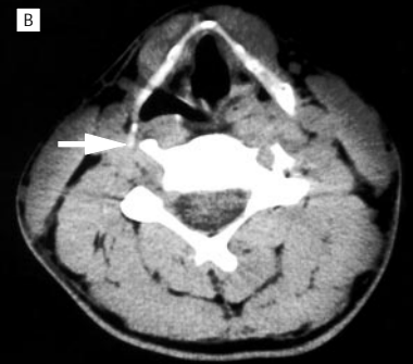
Figure 2. A, Axial plain computed tomographic scan of the larynx in the neutral position reveals an elongated posterior margin of the thyroid cartilage perched on the anterior surface of a cervical vertebral body transverse process (arrowhead). B, Axial computed tomographic scan with the head turned to right shows the thyroid cartilage posterior alar margin has "jumped" off the transverse process (arrow).

clicking, which usually required neck turning and/or neck flexion. As we became more confident of the source of the clicking, general anesthesia was used. In the 4 patients operated on at UCLA, general anesthesia was used with 1 patient and local anesthesia with 3. Findings at surgery included fracture of the superior cornu, posterior displacement of the superior cornu, abutment of the superior cornu